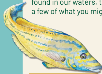
Cuckoo wrasse □

What did you see on your snorkel? Share your experience with us by tagging #SnorkelPortelet or #SnorkelBouley