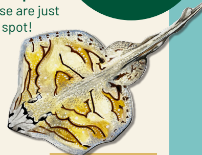
Undulate ray □