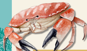
Brown (chancre) crab □